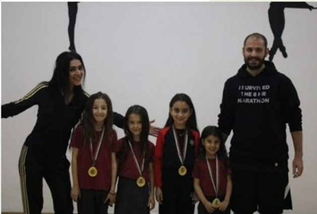
PS Stallions Academy Zumba