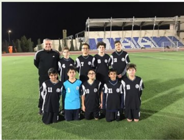
U12 Boys Football