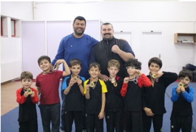
PS Stallions Academy Jiu-Jitsu