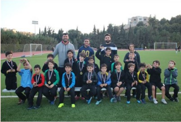
PS Stallions Academy Football