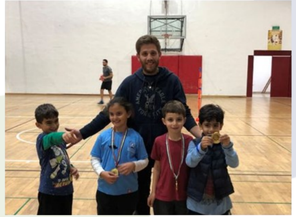
PS Stallions Academy Basketball