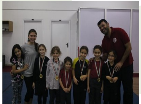
PS Stallions Academy Gymnastics