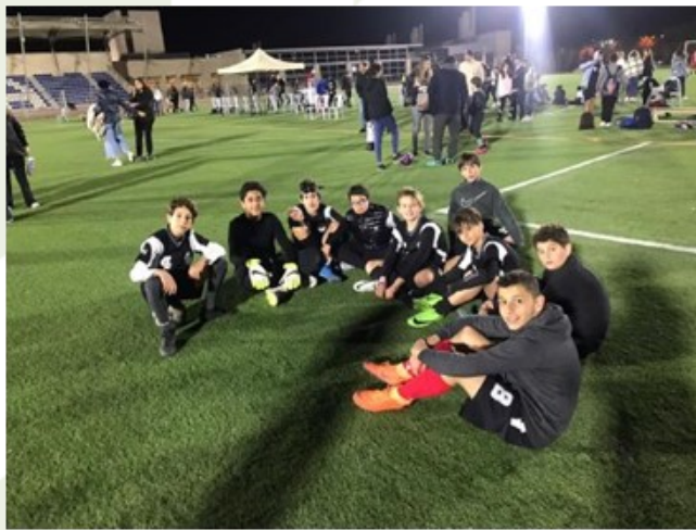
U14 Boys Football (Knights)