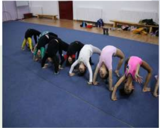
Grades 1-3 Gymnastics