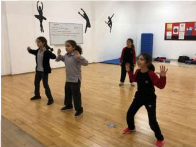
Grades 1-3 Zumba