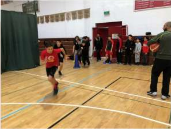
U14 Boys Basketball Team