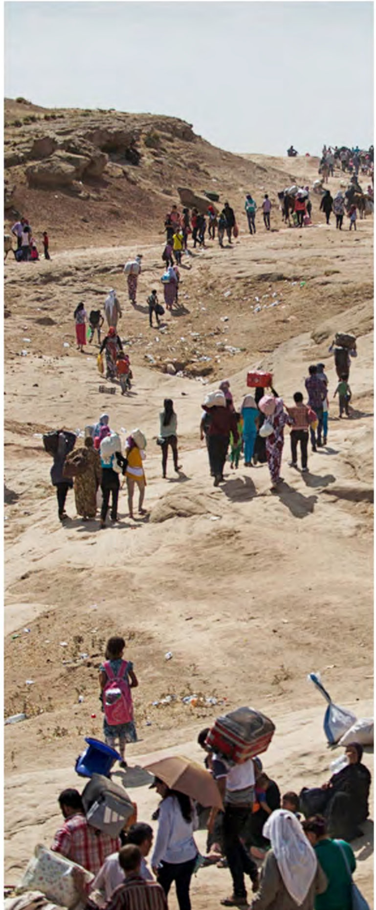
Syrian Refugee Crisis. Digital image. NY Times. Web.

However, the growing issue is that Jordan is widely known for its limited natural resources, consistently high unemployment rates, and its budget is substantially dependent on foreign aid. These factors have both limited its capacity to take in refugee populations and led to growing public protests and calls for reform from the people. Although not signatory to the Refugee Convention, the Jordanian government remains open to working with international actors inside its borders to address humanitarian concerns. This however has created a rather controversial issue that needs to be discussed and up till now there hasn't been a definite answer on what's going to happen next and how is it going to be carried on from there. Should the Jordanian government ban the entry of other Syrian refugees and limit their supply or should the Jordanian government sacrifice its resources and act as the typical Arab neighbouring country and be open to all consequences as that's what the people are expecting to happen and in order to avoid all comments of other countries.