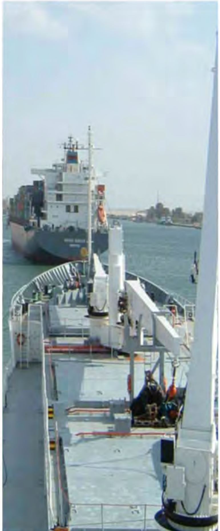
Suez Canal.

The Suez is not only strategically important as a link between the opposite hemispheres of the