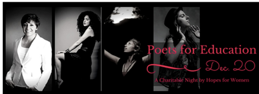
Poets for Education.

P.s. For all those attending and wanting to reserve seats, please RSVP by sending an email to info@hopesforwomen.org with subject line: "Charity Event RSVP" - please note the number of seats you want to reserve!