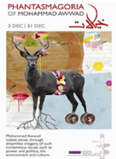
Awwad, Mohammad. Phantasmagoria. Digital image. N.p., 2014. Web.

Don't miss the Arsheef: An exhibition by Warshe. This exhibition gives you an insight into the past and present as it displays an archive of old Arabic newspapers, magazines, and vinyls all released between the 50s and 70s. Transported from dusty shelves behind closed doors to posters on walls and audio/ visual art.. So if you're looking to go back a few decades, this exhibition is just for you.