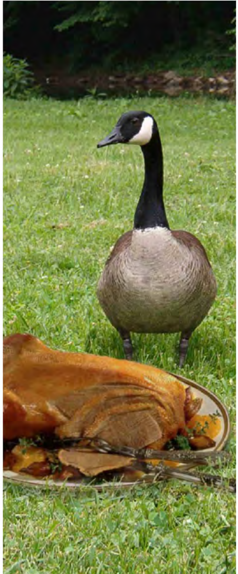
Cooked Goose. Digital image. Caligula Vs. Nero. N.p., n.d. Web.

This actually wouldn't be so bad if geese were completely harmless like chickens or angry 5th graders, but no. Goose attacks often result in broken bones and head injuries which is bad in of itself, were it not for the fact that geese specifically target children and the elderly in groups of large people. What makes this way worse is that geese have extreme resilience, are very territorial and possess some freaking Assassins Creed eagle-vision level of eyesight and have a knowledge of body language that rivals a master detective's. When in contact with a hostile goose the best advice is to hold your arms up, pray, maintain goose eye contact and back away slowly while never squinting your eyes or moving your torso or shoulders away from the goose, geese will see these as a sign of weakness and, seeing as they are total jerks, will accordingly attack. Sometimes even the proper precautions