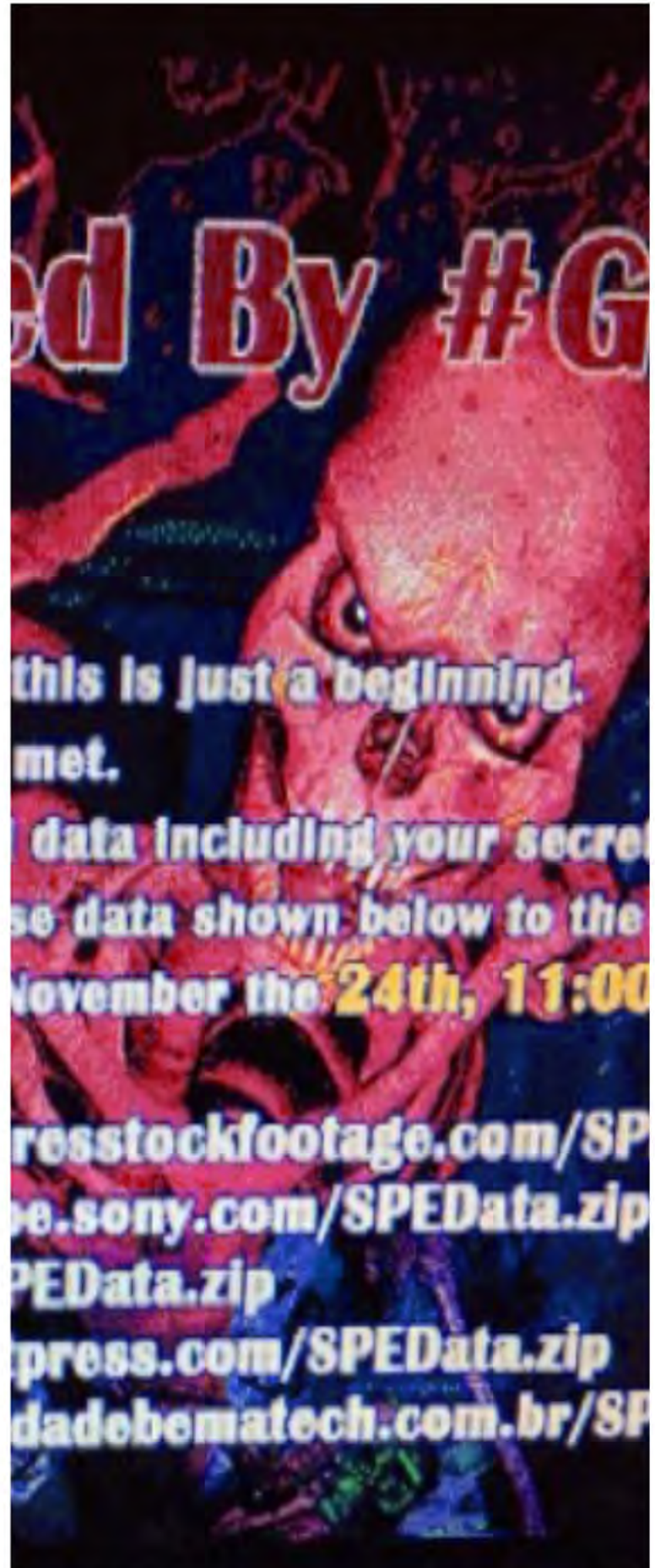
Hacked by #GOP. Digital image. Ubergizmo. N.p., 24 Nov. 2014. Web.

How, why, or when the attack occurred remains unclear. Various celebrities were dissed, SSN's were released, and many pieces of sensitive and valuable information were leaked. What remains to be true is that this group, the GOP, is out for revenge. The question is, who are they after?