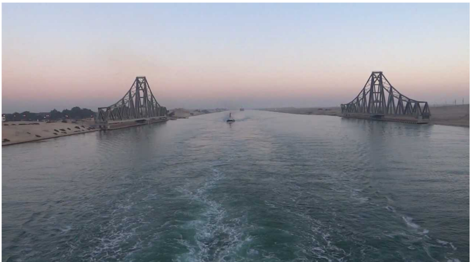
Suez Canal Southbound Voyage. Digital image. Youtube. N.p., n.d. Web.

The finished canal project (which entails six canals) is expected to produce a whopping one million new jobs and boasts an added "Technological Valley" in Ismailia, an undertaking nearly as ambitious as the Millennium Goals except that it actually has a chance to succeed. The finished canal project will expand the number of ships that the Suez can take from 49 to 97, nearly a double and is expected to see canal revenues increase by 259% from the current $5 billion. The first canal has received all necessary funding and construction has begun on it. It alone is expected to increase Suez revenue by $1 billion annually; however the completed project is said to require a further $8 billion in funding for completion. Following the successful funding Al-Sisi proclaimed that the first canal will be finished by August of 2015 due to "deteriorating security conditions".